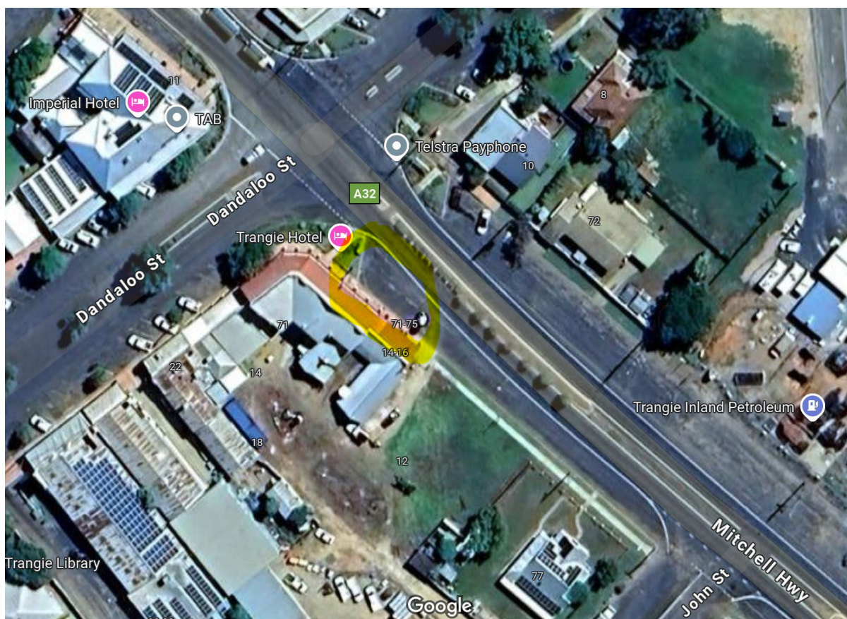
Figure 1: Aerial location of proposed "No Truck Parking" area